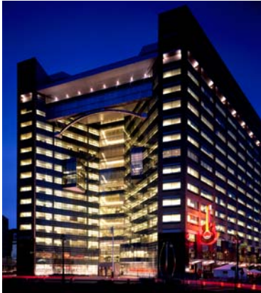
New Compuware World Headquarters in Detroit, MI

Compuware is a billion-dollar company delivering software tools and professional services that increase productivity for approximately 25,000 customers worldwide. Until recently, their headquarter operations were scattered between several buildings in Farmington Hills, MI, which was creating inefficiencies and lost productivity. In 2001, Compuware began construction on a 1.5 million square foot complex in downtown Detroit and divested their Farmington Hills facilities.