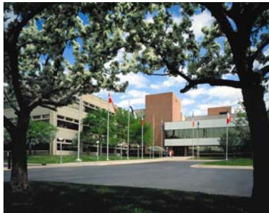
Whirlpool Corporate Headquarters, Benton Harbor, MI

When Whirlpool Corporation migrated its central data center in Benton Harbor, Mich., from a mainframe environment to a high density server environment, the company conducted a