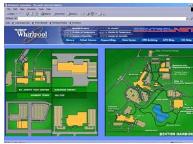
Monitoring the corporate campus at the facility home page.

appreciates the confidence that Whirlpool has placed in them. Since the original integration project, Whirlpool has selected ControlNET for 15 additional automation projects.